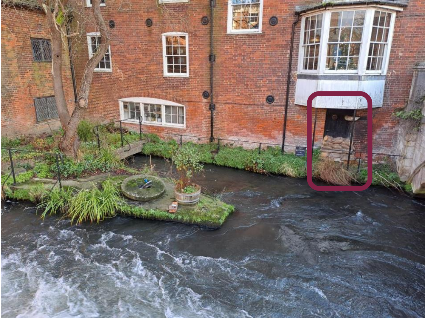
View from access to City Mill