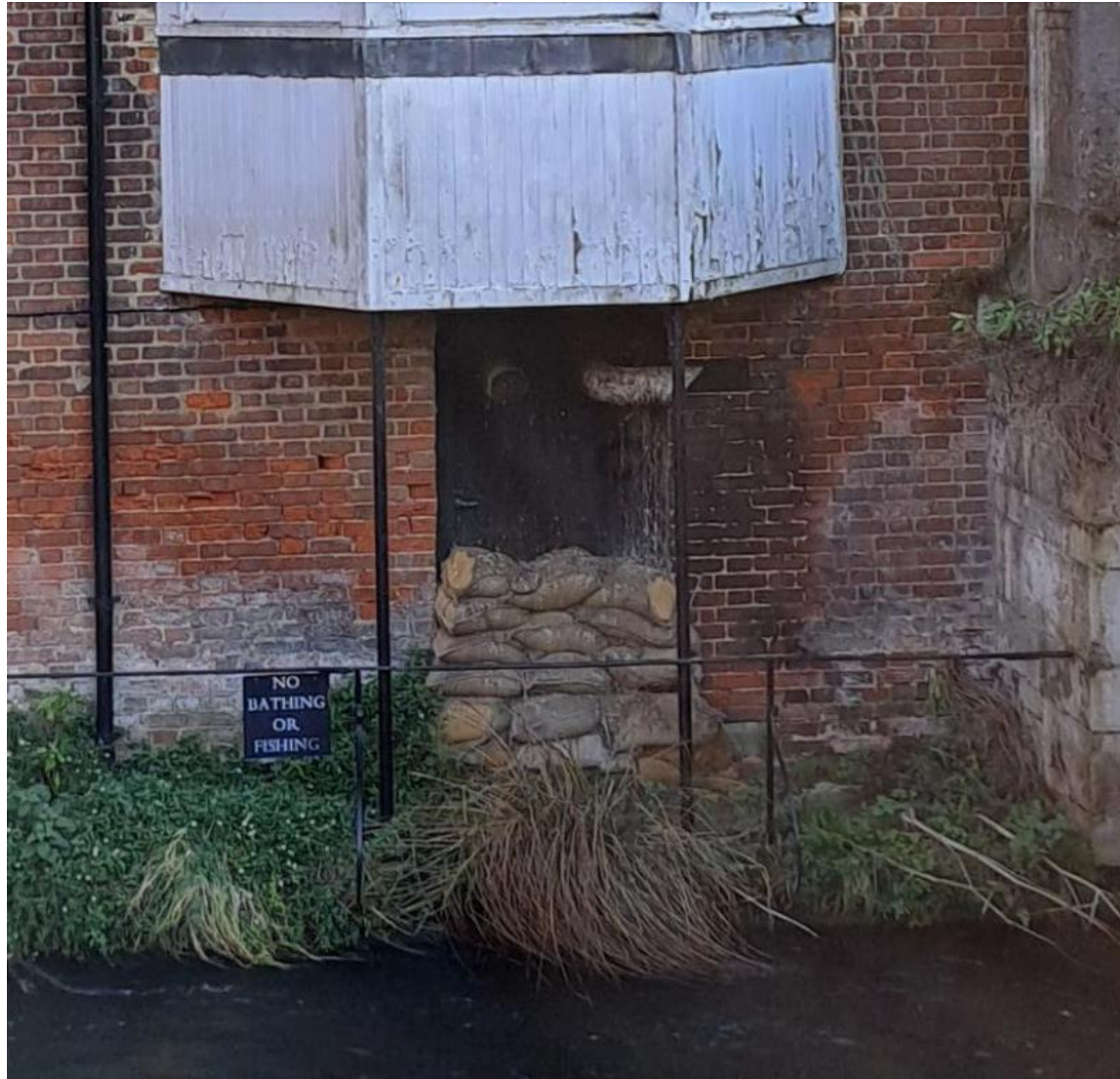
IMAGE OF DOOR